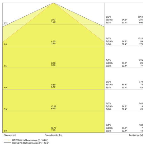
LDC typ cone